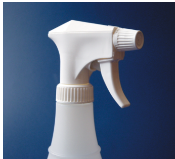
Non-Aerosol Fully assembled ready-to-use Trigger Spray/Bottle.

Expiration date and lot number on each bottle and each box. Quality Control and Validation processes only once.