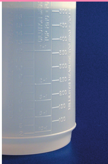
Graduated Spray bottle for precise dispensing.